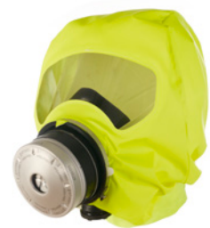
Dräger PARAT® 4900 Escape Hood