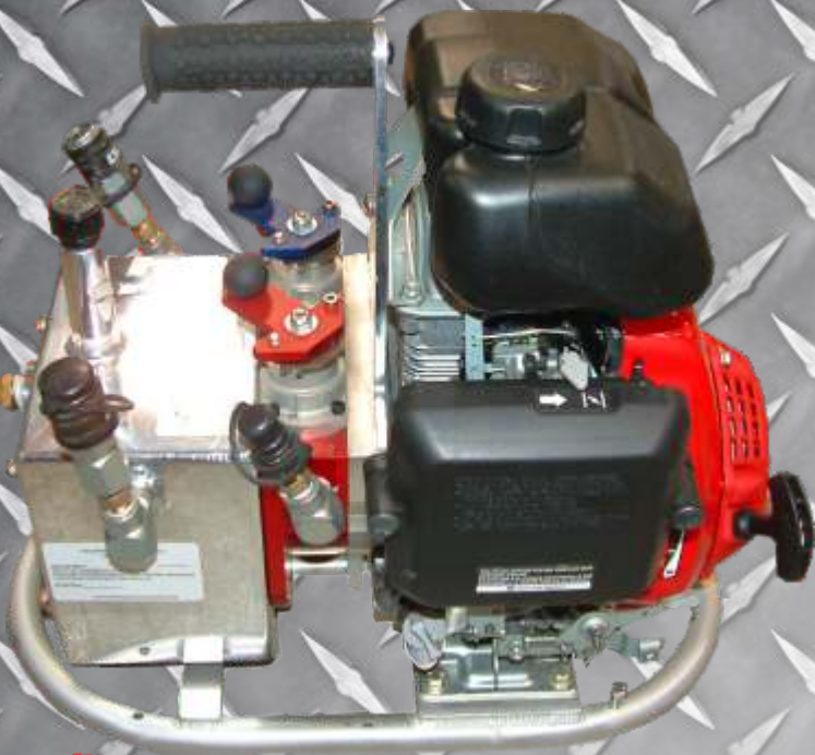
3.0 HP Simo Power Unit 5,000 PSI or 10,500 PSI