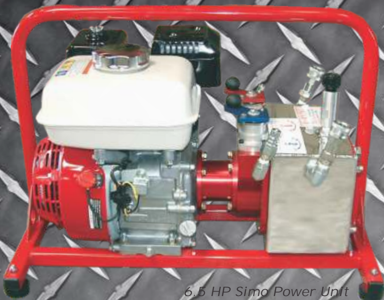
6.5 HP Simo Power Unit 5,000 PSI or 10,500 PSI