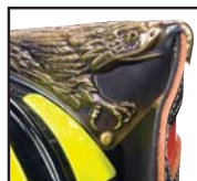
Carved Brass Eagle