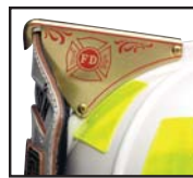
Silk-Screened Maltese Cross