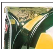
Silk-Screened Brass Eagle